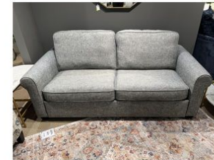
SWINDEN fabric sofa SPECIAL BUY $2,597