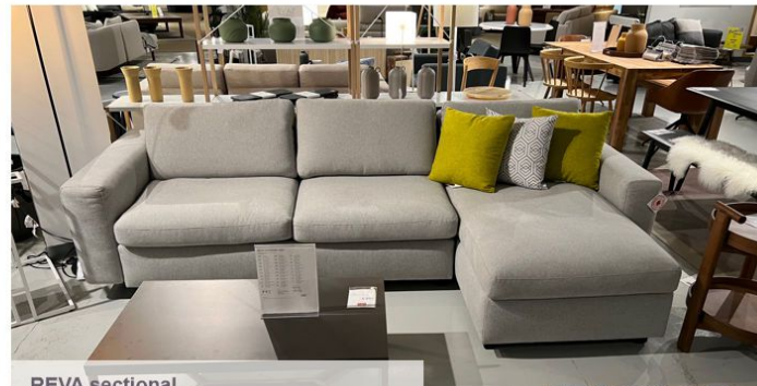
REVA sectional $3,797 PLUS SAVE THE TAX