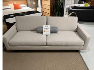
OSKAR fabric sofa SPECIAL BUY $2,097