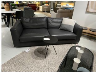
CELLO leather sofa SPECIAL BUY $3,249