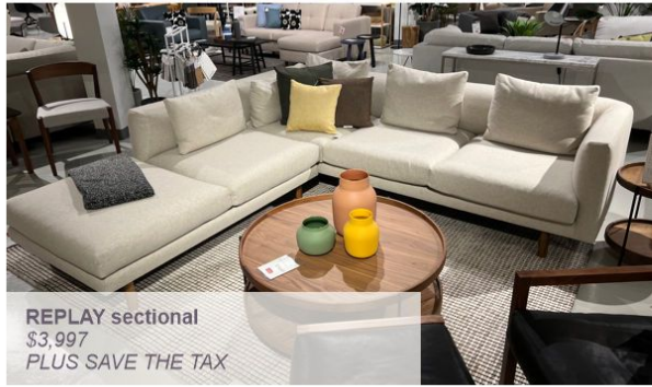
REPLAY sectional $3,997 PLUS SAVE THE TAX