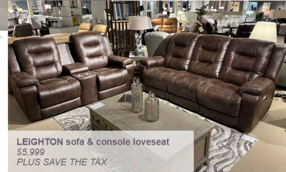
LEIGHTON sofa & console loveseat $5,999 PLUS SAVE THE TAX