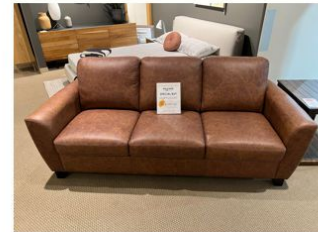
MARYMOUNT leather sofa SPECIAL BUY $1,997