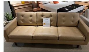
JOAN leather sofa SPECIAL BUY $2,197