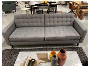
REVERIE fabric sofa SPECIAL BUY $1,697